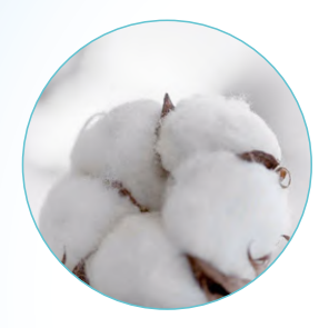
100% cotton spunlace nonwoven fabrics